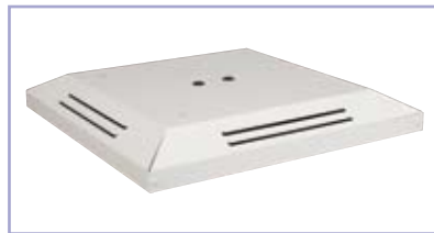
• Back-box rear elevation