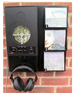
Nakamachi 3Disc+ Shelf