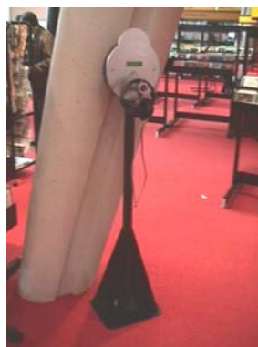
Cloverleaf Silver Stand