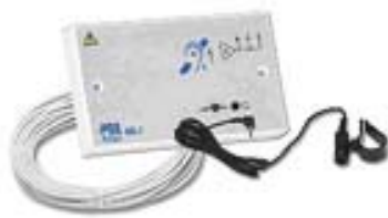
Induction Loop Systems