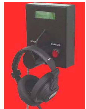
Square Black Box