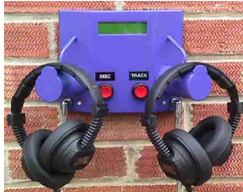
Square Blue Twin